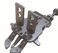
can chose button attachment