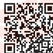
TS-1900A /430D video